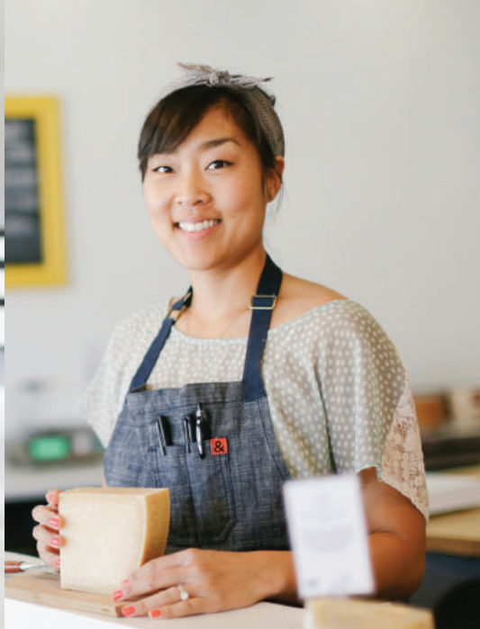
Milkfarm, Los Angeles • Est. 2014 milkfarmla.com