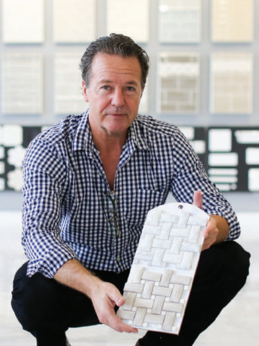
Bentley Adams Tile, Santa Monica • Est. 2016 bentleyadamstile.com