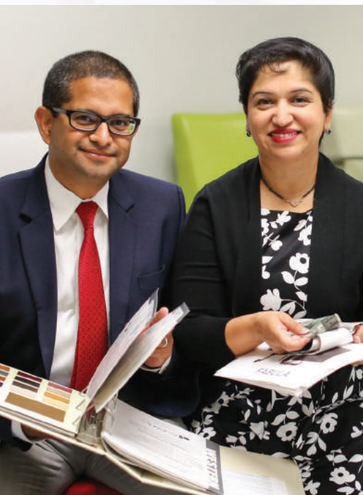
Aura by Murti, LLC, Torrance • Est. 2010 auraseating.com