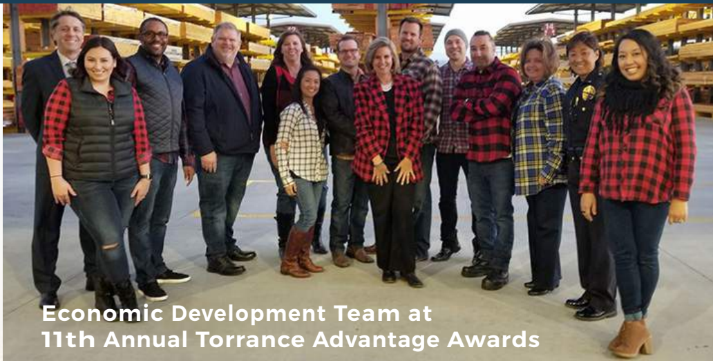
Economic Development Team at 11th Annual Torrance Advantage Awards

Torrance is a premier city, balancing the commercial, industrial and residential sectors. Our mission is to help existing businesses grow, attract new investment, strengthen infrastructure and improve the economic base. Our Economic Development Team includes staff with a range of expertise to help with all aspects of doing business in Torrance.